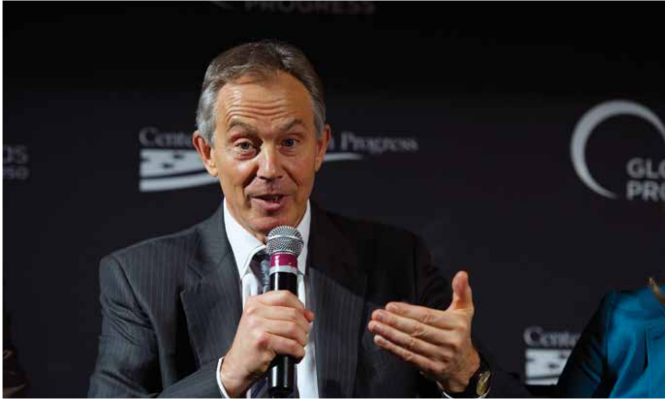
Tony Blair speaks at the Global Progress meeting at the United Nations in New York, December 2010.

In many political cultures, there is resistance to such change from both old party elites and rank-and-file members. Change is disruptive, but resistance to change is a risky strategy. Many young people no longer view organized politics or traditional political parties as the best route to improving their lives or engaging with the issues they care about. When mainstream political parties seem exclusive, elitist, and out of touch, they sow the seeds of populism. Yet as the contributions to this volume illustrate, progressives can overcome the wave of cynicism and anti-politics that has engulfed parties on